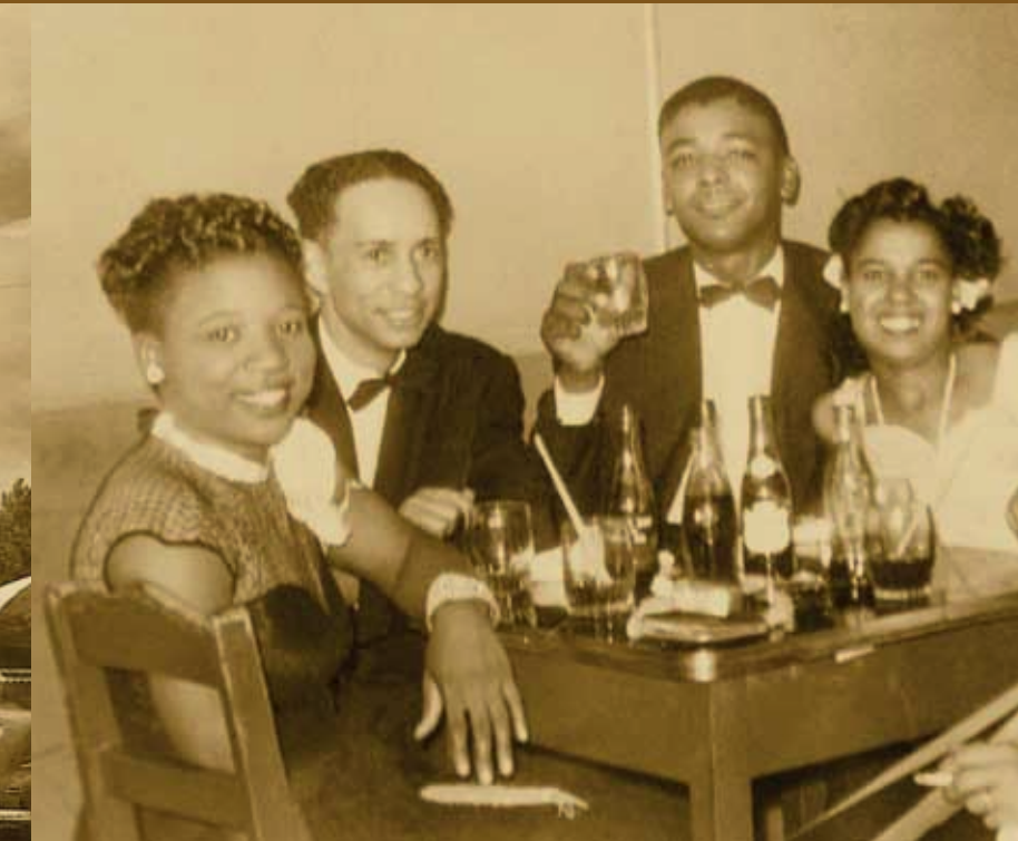
DUTCH MILL RESTAURANT

City of Duluth, City Clerk & Business Office